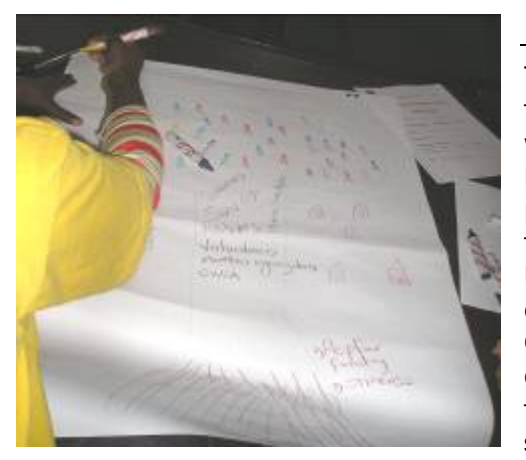
Workshop participants draw depictions of what they could do with increased funding.