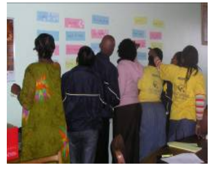
Workshop participants identifying important best practice themes during the AI workshop.

When designing this research, we used appreciative inquiry (AI) concepts to help focus the evaluation, and to develop and implement several data collection methods. Appreciative Inquiry was chosen as the overarching approach, because it is a process that inquires into and identifies "the best" in an organisation and its work. In other words, applying AI in evaluation and research is to inquire about the best of what is done. This differs significantly from traditional evaluations and research where the subjects are judged on aspects of the programme that are not working well. For this case study, AI was used to identify strengths (both known and unknown) in the Hope Worldwide OVC programme, and to identify and make explicit areas of good performance, in the hopes that such performance is continued or replicated.