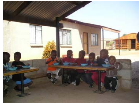
Children at the Khayaletu 2 Community Care Centre eat lunch.

Food and nutritional support form an important part of the Orphan Care Programme. The children attending the community care centres receive lunch each week day. School going children are transported from their schools to the centre where they eat lunch before beginning their homework. Children are only eligible for food assistance or meals if they are attending school, which encourages the children to continue to attend school. Meals provided to the beneficiaries are planned by a nutritionist. This ensures that the children receive one meal a day. Each care centre has a community garden on the property that is tended to by primary care givers. Produce from the community gardens is used for the children's meals. Primary care givers also receive produce from the garden as an incentive for their involvement. Identified children are also eligible for food parcels that are distributed monthly in weekly cycles. This is currently on hold due to funding delays.