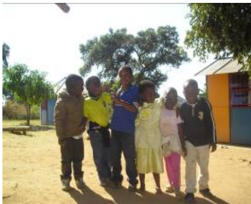
Children gather at the Lula Centre during playtime.

Masoyi Home-Based Care came into being in 1998 when it began providing home-based care to the sick and dying in the Masoyi area. It began as an initiative under the Africa School of Missions, a Christian teaching college based in Masoyi. The school site remains the project headquarters for Hands @ Work. Since then, it has expanded rapidly into a multi-layered and holistic project providing multiple services and activities.