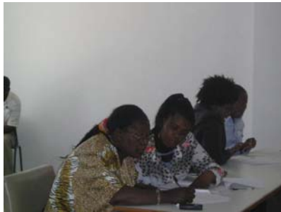
Workshop participants complete appreciative inquiry interviews.

When designing this research, we used appreciative inquiry (AI) concepts to help focus the evaluation, and to develop and implement several data collection methods. Appreciative Inquiry was chosen as the overarching approach, because it is a process that inquires into and identifies “the best” in an organisation and its work. In other words, applying AI in evaluation and research is to seek out the best of what is done, in contrast to traditional evaluations and research where the subjects are judged on aspects of the programme that are not working well. For this case study, AI was used to identify strengths (both known and unknown) in the Hands @ Work and Masoyi Home-Based Care OVC programme, and to identify and make explicit areas of good performance, in the hopes that such performance is continued or replicated.