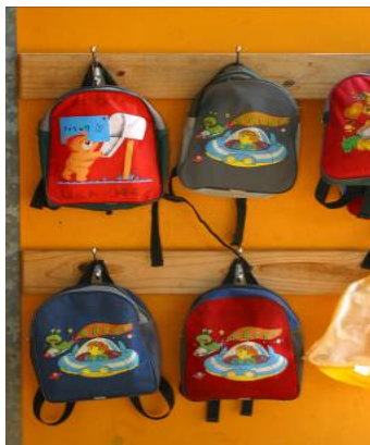
Children's school bags are stored at the Lula Centre.

The provision of educational support to beneficiaries takes place at multiple levels. The design and delivery of these services to OVC is a major strength of the Orphan Care Programme. Children six years old or younger attend the early childhood development programme that is run from two community care centres during the week. Children enrolled in school are assisted with uniform and school so that they not marginalised based on their appearance. One beneficiary shared by saying, "We feel proud because no one discriminates against us because of our clothing. Through Masoyi Orphan Care Programme, no child goes hungry, naked or does not go to school because their parents have died."