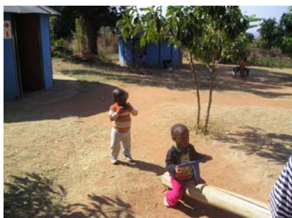
Children play at the Lula Multi-Care Centre.

The Orphan Care Programme has evolved and expanded with the increasing numbers of OVC in Masoyi. Through this expansion, the programme has been able to identify the most successful ways of doing things. This has been driven by the imperative of providing children and primary care givers with holistic comprehensive services in the context of limited resources. The programme has been successful in harnessing existing knowledge and resources within Masoyi and abroad. It has also faced challenges of retaining staff and volunteers in a sector where the emotional burden is heavy. Despite this, it has done well at fostering teamwork, cooperation and openness among staff. This section will highlight the innovations and successes of the programme and will touch on some of the challenges it faces.