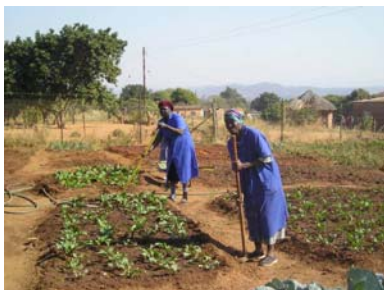
Women cultivate a garden at Khayaletu 2 Community Care Centre.

The community care centres are centrally located and are within easy access of children and community members. The Masoyi Orphan Care Programme requires that primary care givers are involved in the project on an ongoing basis and have regular contact with staff at the community care centre. Food gardens are located at both centres. These gardens are tended to by primary caregivers or community members on a daily basis. It is very clear that the gardens are flourishing and provide healthy, fresh produce. The primary care givers express great pride in maintaining the gardens and showing the produce that the garden yields. The produce is used