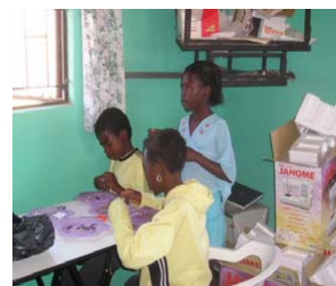
Children attend Vocational Skills at K2 on a Saturday.

Vocational skills training is central to the work of Masoyi Home-Based Care. Beneficiaries are provided with training in hairdressing, beadwork and sewing. This skills training is offered by community members. Programme staff place significant value on the teaching of vocational skills as it is seen as a means of income-generation for beneficiaries and volunteers. Some of their products are available for purchase at the K2 Care centre. The teaching and training of community members in building and construction skills is another very important vocational skills initiative. The initiative was begun by an international volunteer who trained interested community members in building and construction skills. Through this training and support, Masoyi Home-Based Care has introduced and incorporated a full time building team as part of Masoyi Home-Based Care.