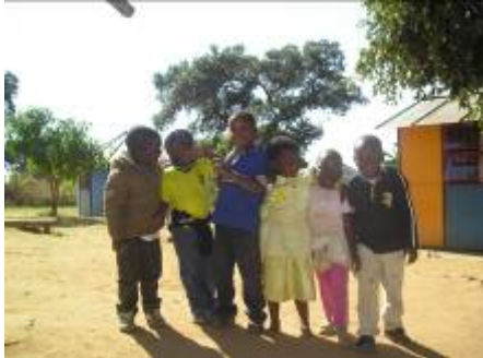
Children gather at the Lula Multi-Care Centre.

The Orphan Care Programme run by Masoyi Home-Based Care will remain the test bed for new ways of doing things. It is a model that has achieved great things and is able to inform the evolution of orphan care programmes across the continent. The programme will continue to focus on developing the Masoyi model and mentoring similar organisations across the world.