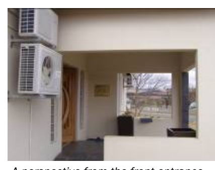
A perspective from the front entrance of the Khanyiselani resource centre. The site is leased from local government. The renovations and furnishing of the centre was undertaken by the Department of Public Enterprises and it was officially opened by the minister, Mr. Alec Erwin, in October 2006.