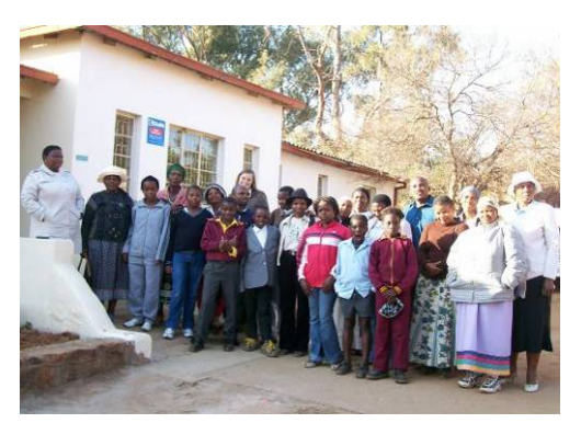
All of the participants from the workshop, including staff members from the umbrella, member organisations, ward councillors, community leaders, OVC and their guardians.

MK HCBC plans on continuing its present programme. That said, the programme also plans to scale up training efforts, extend reach to more communities, mobilise more resources and acquire means of transportation to remote locations.