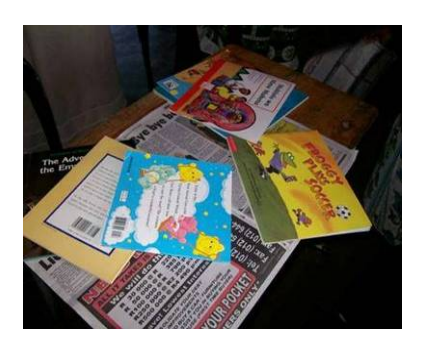
Books used at the Mohklarekoma drop-in centre as educational tools for children that do not have