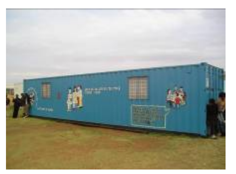
A converted shipping container is used by Noah, located on the property of a local church.

Communities play a central role in the work of Noah. This is demonstrated in the commitment of resources to the Arks. These resources range from time given by volunteers and Ark committees to the provision of space and food to the Arks. In some KZN Arks, local farmers support Arks through the donation of fresh produce.