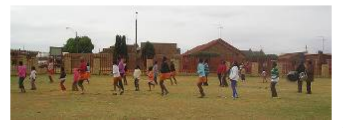
Children dance to drumming by volunteers.

The Noah model rests heavily on the involvement of volunteers and committee members who are drawn from the surrounding community. This is based on the belief that community members have a better understanding of community dynamics and are likely to demonstrate greater commitment than people who are not from the community itself.