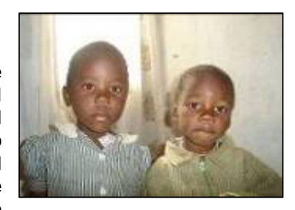
The project provided Christmas groceries to these children during 2006.

When available, OVC receive nutritious food parcels that include items such as maize meal, beans, tinned fish, cooking oil, and peanut butter. Instant fortified porridge is provided to the very ill and malnourished children. The project lobbied a local clinic to provide free milk formula to mothers who are HIV-positive and are unable to breastfeed. OVC also receive vegetables from the projects two vegetable gardens, one on-site and the other at the local clinic. From June 2006 to June 2007, 53 OVC have received food and nutritional support and 47 food parcels.