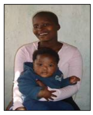
The project aims to involve children in decision-making processes that affect OVC.

Focus group discussions, workshops, and awareness campaigns are regularly conducted to provide age-appropriate HIV/AIDS prevention education to children. Such education allows children an opportunity to develop healthy living attitudes and behaviours. It also lays an early foundation for minimising HIV/AIDS risk in adulthood. A total of 90