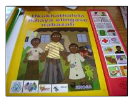
Teaching materials the project uses to guide community members in OVC care are displayed.

OVC, particularly the older children, are encouraged and supported to generate an income from selling vegetables grown in their own gardens. When children reach the age of 18, they are assisted in accessing vocational training or in pursuing tertiary education. Training in gardening skills is a popular skill that is taught to the children. A community member teaches the gardening skills to the children on a voluntary basis. Following training, OVC are encouraged to start their own vegetable gardens. These skills are important in that the children use them to provide their families with fresh vegetables and to generate money from selling surpluses.