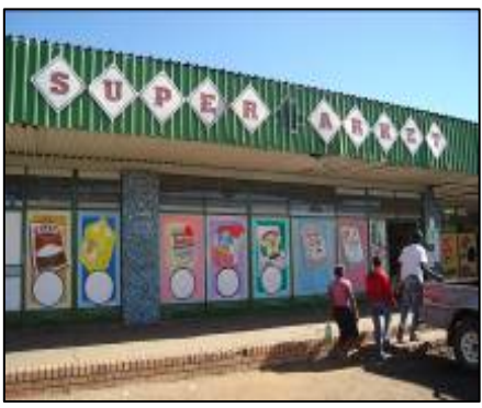
Networking with local business, such as this supermarket, the project has managed to assist OVC households with groceries and other household items.