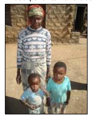
A granny-headed household in Winterveldt.

The beneficiaries of the OVC component of the project are orphans and other children 17 years of age or younger who are vulnerable due to HIV/AIDS and other issues. The vulnerable children include those who are living in extreme poverty, those living with terminally ill parents, children whose parents have abandoned them (typically to go to big cities and never return), and babies