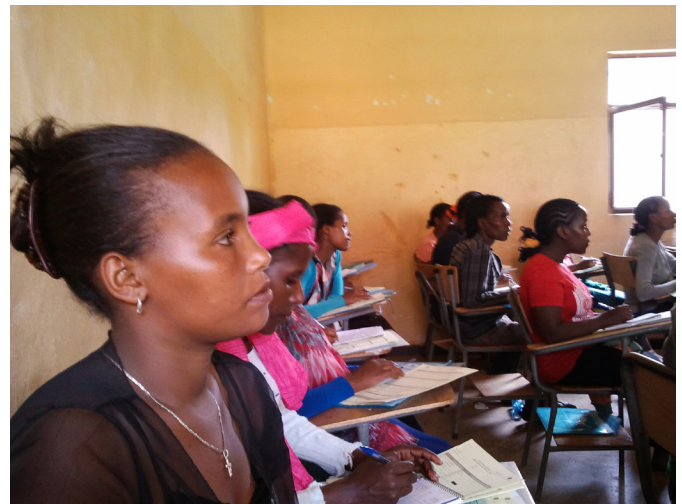
Figure 1. Training of Health Extension Workers.

The scale-up process was initiated in October 2010 by providing orientation and sensitization of regional, zonal and woreda health managers. This was considered as the essential first step to ensure ownership and support for CHIS at all the levels of health administration within the region. A pool of facilitators in SNNPR was created by providing training of trainers (TOT) to Health Extension Program (HEP) coordinators from zonal health departments and woreda health offices and to HEW supervisors from the health centers. Since the HEP coordinators and HEW supervisors are the ones in charge of supervising HEWs, it was considered pertinent that they should be the ones in charge of training the HEWs (Figure 1). In this way the HEW supervisors and their managers would be able to provide relevant technical support to the HEWs during their subsequent supervisory visits.