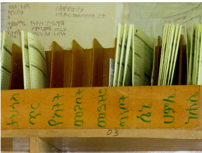
Figure 4. Tickler Box.

still remaining in that month's slot, the HEWs know the clients who have defaulted; therefore they can take appropriate measures to get to those clients.