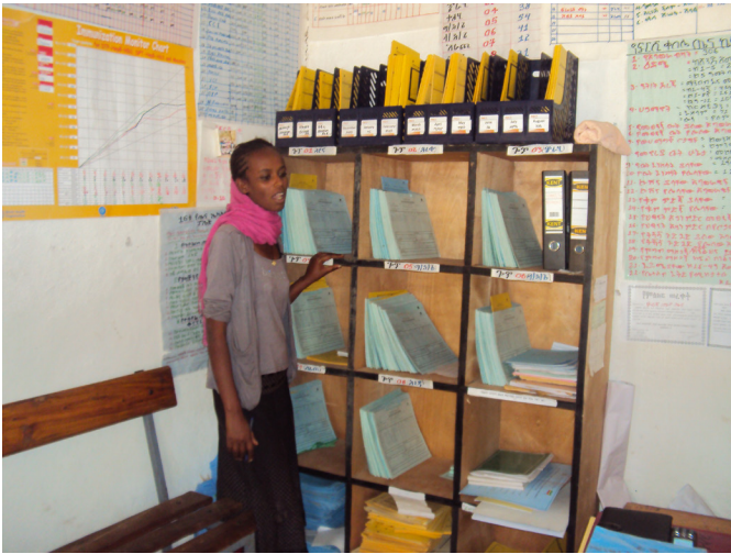
Figure 3. Filing of Family Folders by village and Health Cards arranged in Tickler File.