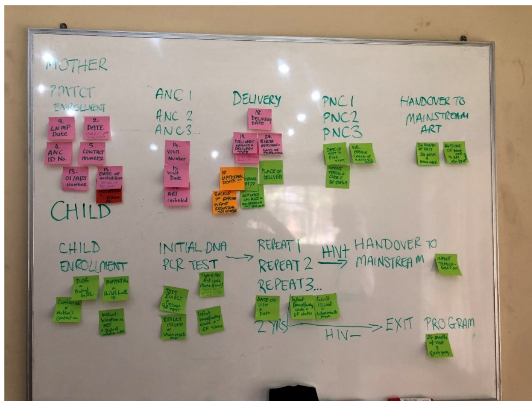
Figure1. Mapping the PMTCT Tracker data elements to the clinical registers