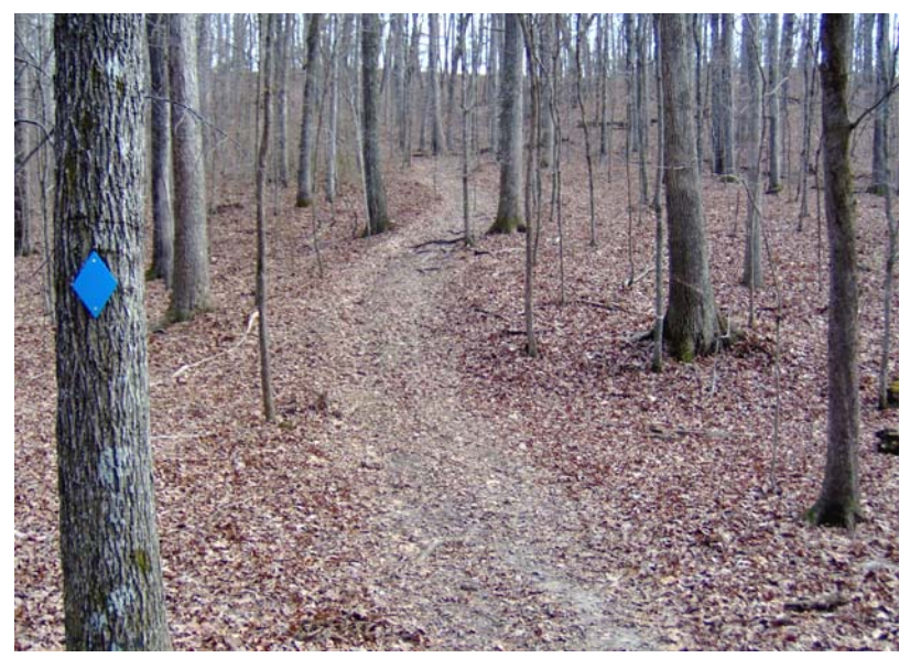
Designated trail in Turkey Bay OHV Area.

In Turkey Bay, 106 miles of OHV trails were signed and designated. OHV trail inventories were entered into INFRA database. The new Turkey Bay OHV Area facility map identifies designated trails and communicates a resource stewardship message.