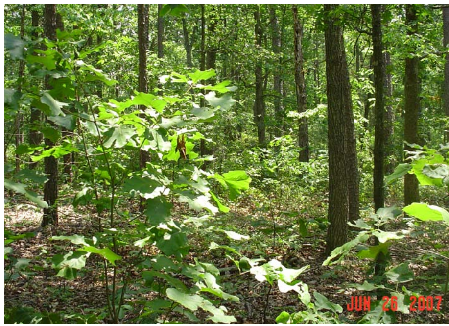
Devil's Backbone Shortleaf Pine Area – Present Condition.

Forest Management needs to increase the supply of regenerating forest habitat and provide for more mid-age forest through thinning and shelterwood. The lack of regenerating shortleaf pine around Devil's Backbone is especially concerning. Prescribed fire is starting to reduce the midstory and develop an herb layer in the Prior Creek Project Area and OGRDA.