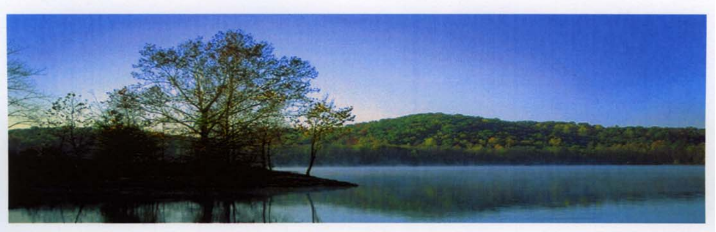
Land Between The Lakes undeveloped shoreline.