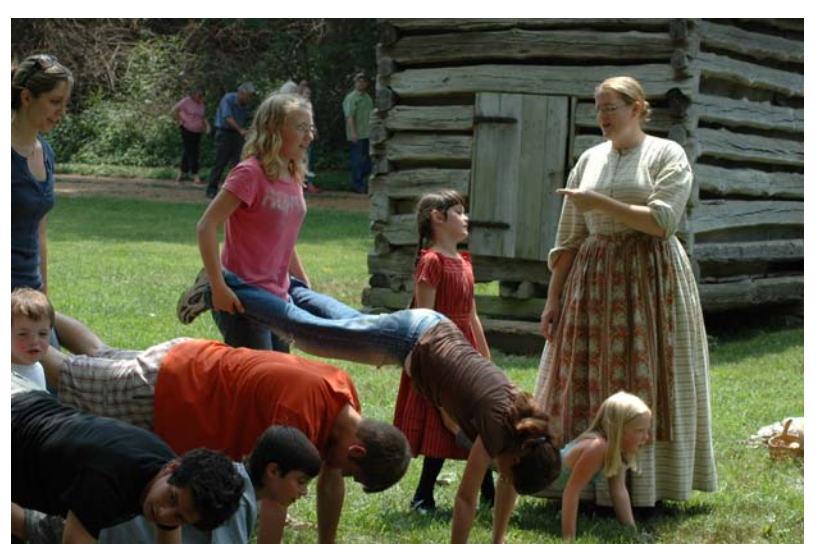
Independence Day provides children opportunities to learn and play 1850's games.

A diverse array of interpretive panels exists in LBL at remote and dispersed locations for the visitor to less developed sites (Iron Furnaces, St. Stephen's Church, South Bison Range, etc.). Over 100 educational brochures and hand outs are available on such subjects as ticks, deer, elk, and other favorite topics. The website, <a href="www.lbl.org">www.lbl.org</a>, contains educational messages throughout. We cannot say we reach 100% of the visitors here at LBL, but these diverse methods and media show we are reaching out.