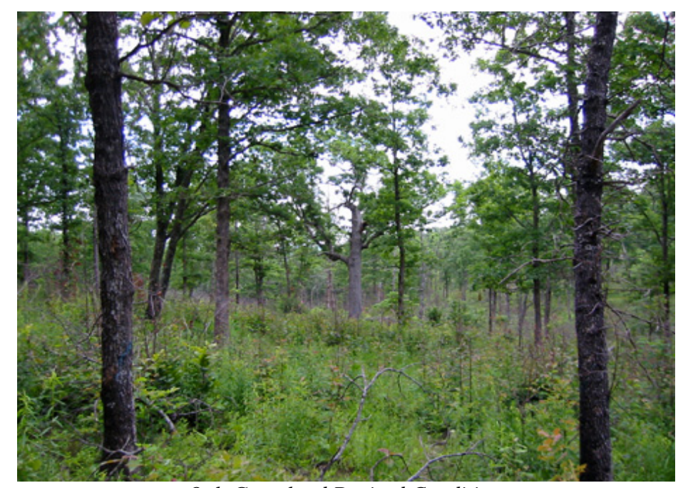
Oak-Grassland Desired Condition.