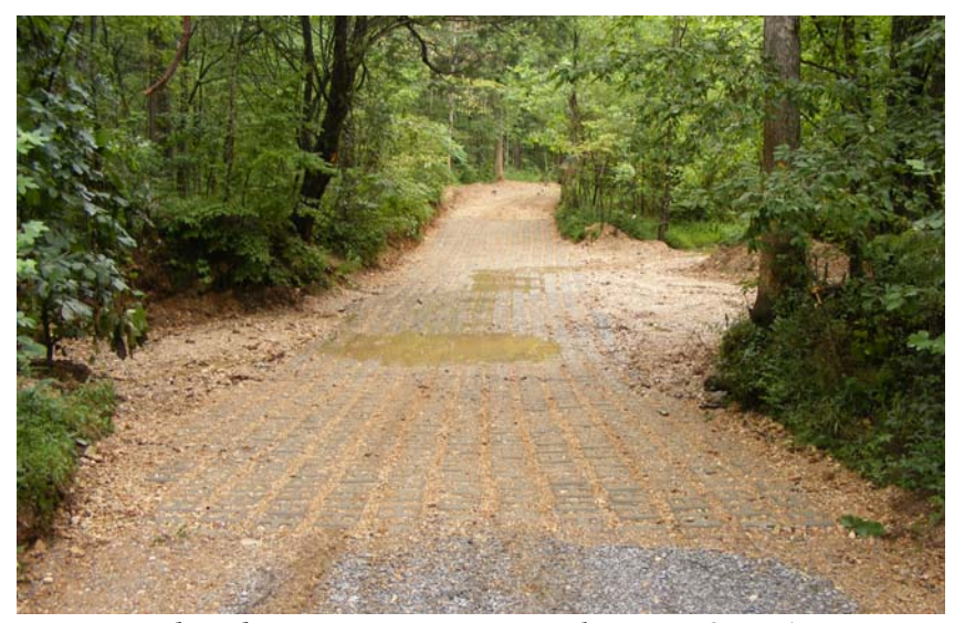
Hardened stream crossing in Turkey Bay OHV Area.

Two hardened stream crossings were constructed utilizing geotextile fabric and interlocking blocks. These areas had been heavily impacted by OHV use. Armoring these areas reduced stream bank erosion and lessened sediment transport. Stream bank/riparian area rehabilitation was completed on 0.2 mile of another stream in Turkey Bay OHV Area.