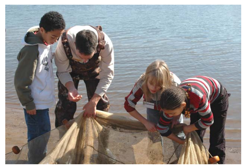
Students learn about lake ecology and explore aquatic life diversity in LBL EE programs.

While we are proudly tracking progress towards achieving the Area Plan goals and objectives, we are obviously just getting underway. The following items are discussed in later narrative.