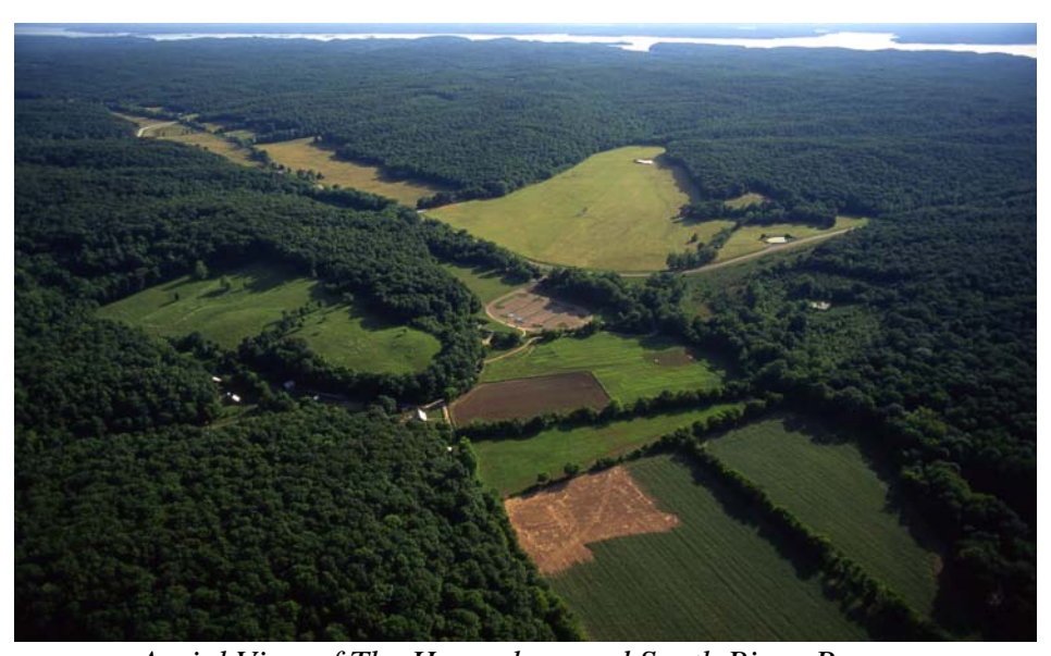
Aerial View of The Homeplace and South Bison Range.