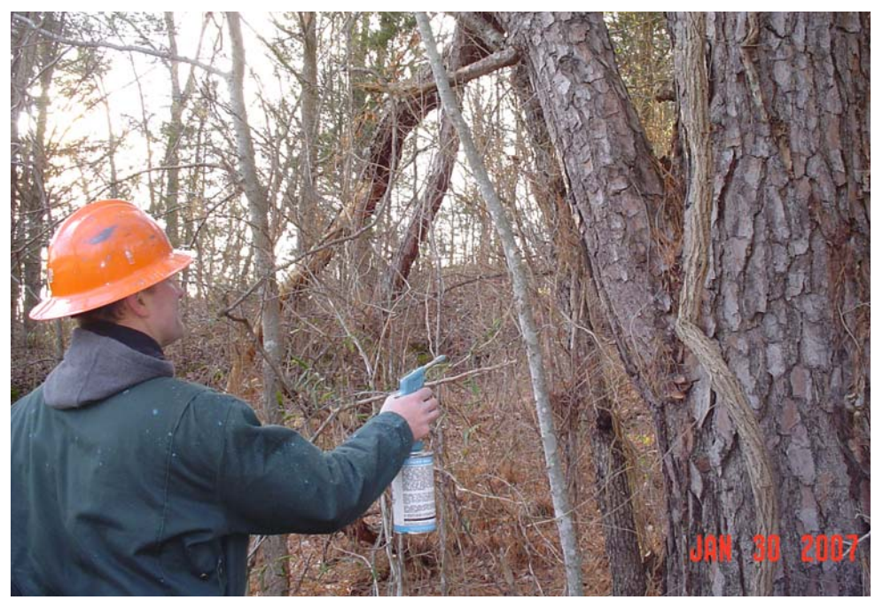
Marking of timber within the highway 68/80 expansion.

Successional stages of forest have changed very little since the Area Plan. Ongoing qualitative assessments of oak-grassland fire and mechanical treatments indicate a significant increase in both early successional species (grasses and forbs) and oak hickory regeneration as shown in Figure 7. Systematic plot monitoring is scheduled for the summer of 2008 to quantify these observations.