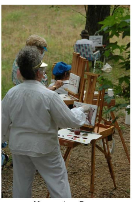
Nature Arts Day at Woodlands Nature Station

North and South Welcome Stations are an important contact with first time visitors as well as explaining the why's of many regulations to repeat visitors. Orientation information is their primary function while delivery of educational messages is common as well.