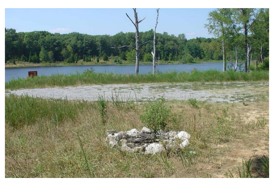
Typical backcountry campsite.

In accordance with the Area Plan, over 250 campsites and access to them were inventoried, evaluated, and documented using GPS. The campsites were evaluated for high, medium, and low use and monitored for baseline levels of impacted area. There are a number of impacted sites in need of maintenance. Natural and monetary resources, along with public input, will be considered as proposals to backcountry and lake access areas are developed.